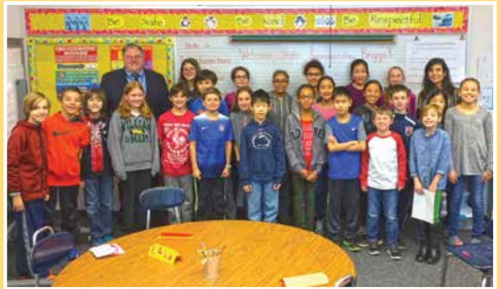
The fifth-grade students from Penn Wynne Elementary School were excited to discuss this year's "There Ought to Be a Law" essay contest.

I look forward to reading their persuasive essays promoting laws that they feel would make their school, community or state a better place. I will announce the winner and finalists this spring. The winner will receive an official citation from the Pennsylvania House and be