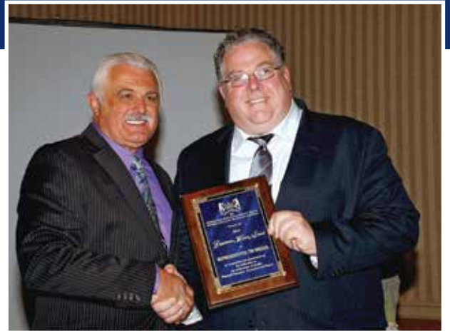
Accepting the PSAHPERD Legislative Honor Award in November.

Some of the initiatives cited by the association were my work in the introduction of the Healthy Kids, Healthy Futures Act (requiring a minimum of 30 minutes of moderate to vigorous physical activity for every child every regular school day), as well as the passage of the Equity in Interscholastic Athletics Disclosure Law (strengthening Title IX reporting requirements for schools), and the Safety in Youth Sports Act (setting new requirements for Departments of Health and Education aimed at preventing serious head injuries in student athletes and raising awareness of how to deal with concussions). I was honored to accept the award at PSAHPERD's State Convention.